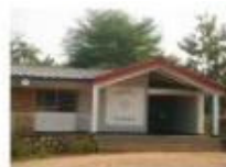
Lycée du Saint-Esprit Gihosha

The College du Saint Esprit (College of the Holy Spirit) was founded by the Jesuits in 1952 on the site of Kiriri. The first cohort graduated in 1958 with 18 Rhetoricians. It was transferred to Gihosha in 1983 and became the Lycée du Saint Esprit retaining its original name. In 2007, there were 846 students of which 54% were girls. Since its creation, there have been more than 3400 graduates. The Association was founded in 1991 and became a legal entity in 2001.