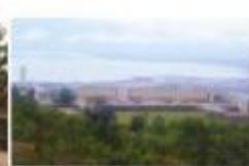
Site of Kiriri Campus (ex-College of the Holy Spirit)